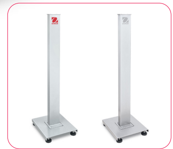
Painted & Stainless Steel Floor Stands (Optional)